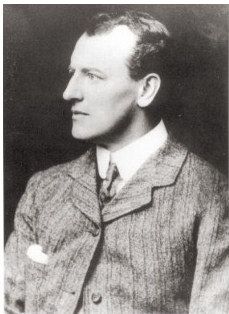
Sidney Edward Paget

Sidney Edward Paget was a famous artist best known for his illustrations that accompanied Arthur Conan Doyle's Sherlock Holmes stories. Paget's drawings appeared in many magazines and his work was well known in the US and the UK. Paget is credited with giving the first deerstalker cap and Inverness cape to Holmes. Paget used the black and white medium to reflect the grim mood of the stories which was a probable influence on American detective movies and film noir and has had a profound influence on every film version of the Holmes stories. Altogether, Sidney Paget did some 356 published drawings for the Sherlock Holmes series and his drawings have become iconic in depicting the fictional character. Paget's original drawing of Holmes and Moriarty in Mortal Combat at the Edge of the Reichenbach Falls was sold by Sotheby's in New York on 16/11/2004 for $220,800. (see below)