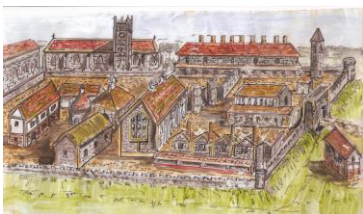
Drawing by Richard Boustred

A royal hunting park was created, and a palace built at the top of Langley Hill: