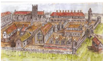
Drawing by Richard Boustred

A royal hunting park was created, and a palace built at the top of Langley Hill: